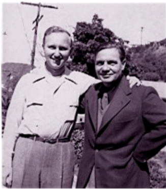
Let's start with Ben Lees in 1950 with George Antheil in Los Angeles.

Benjamin Lees has recently turned 85 years old. In celebration of his remarkable life and career, we thought it would be appropriate to share a few images of Ben and some of the people he's known over the years.